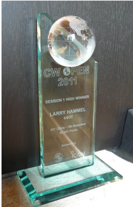
Overall Session & Combined Score Winners